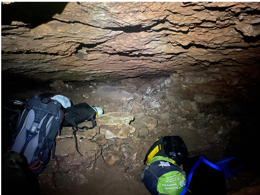
Bags in the second chamber being shuffled to our rest area. While it might not be what you typically see on expeditions this is the best representation of college kid Walmart caving . Photo of Jenna Crabtree.