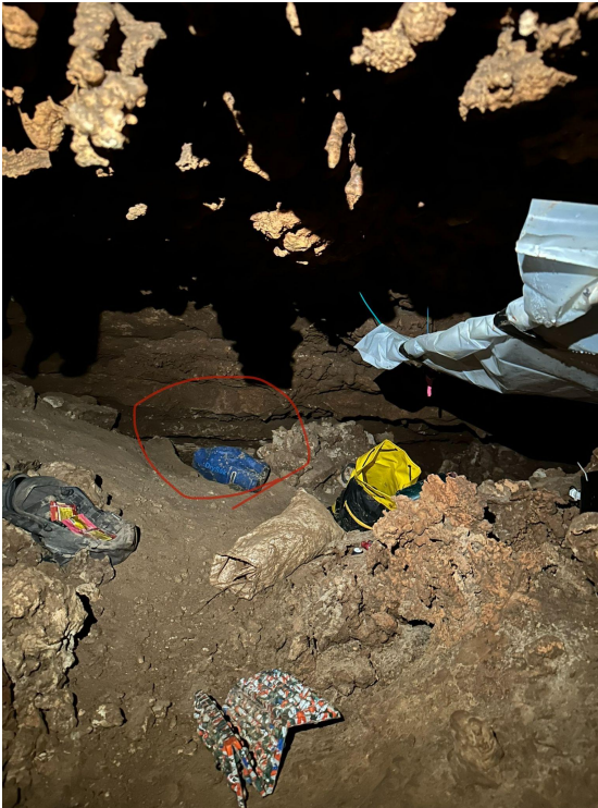
Start of Lead passage.