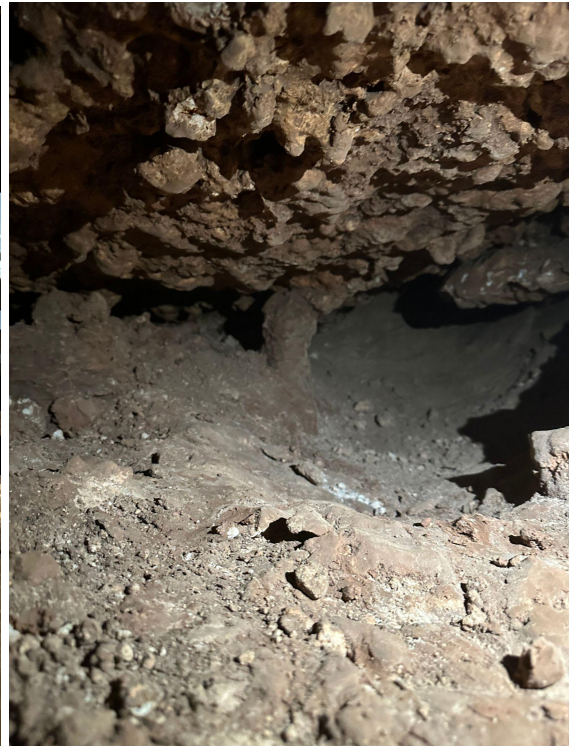
Start of primary digging spot. The passage goes up out of sight.