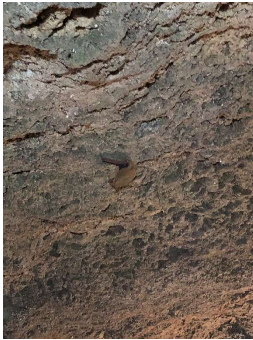
One of the two tricolor bats that greeted the tour group. Its friend was quite chatty, but never revealed itself.