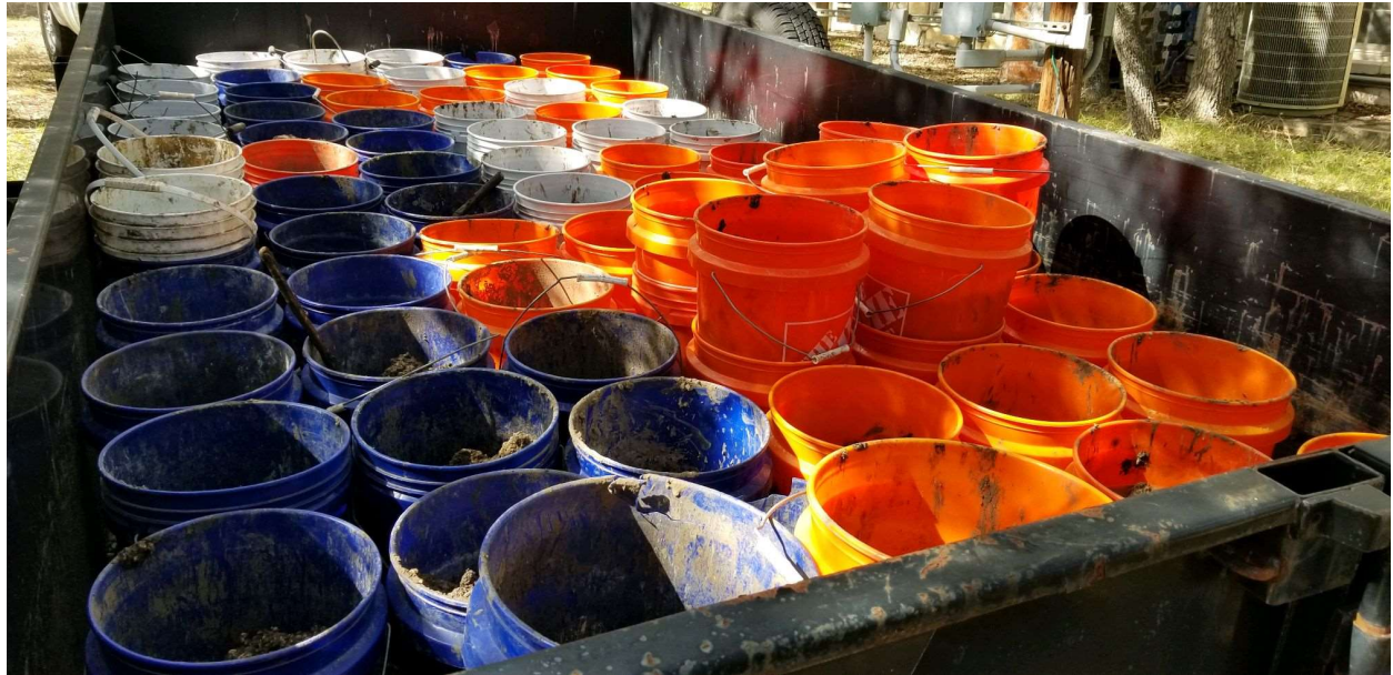
No one thought to take a before photo, so here's the after photo of all the buckets hauled out of the cave.

Once back on the surface, the group had lunch provided by the cave staff. The owner of the cave as well as the staff that managed it thanked and commended the group for their labor and efforts. Shortly after, the group bid their farewell, and left to return to College Station arriving back at 5:15 PM.